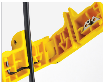
Hinged design opens to accept cable for end and mid-span applications without disassembling tool.