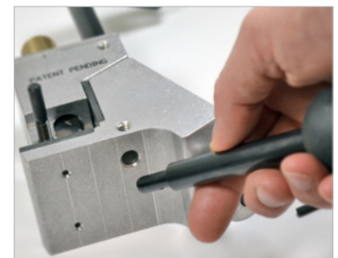
Detachable, ergonomic handles for use in tight spaces.