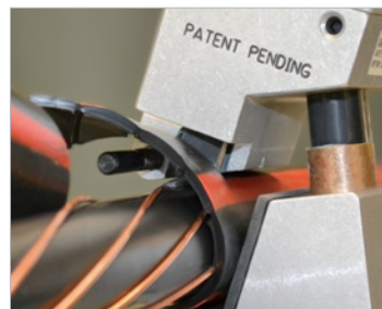
Recessed blade increases safety & is easily replaced.