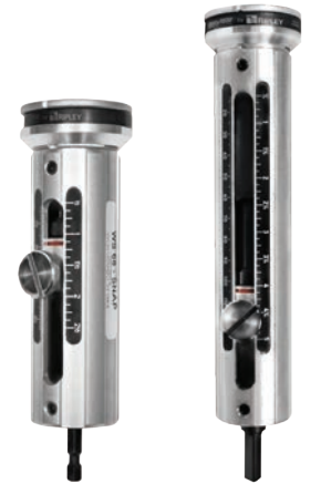
WS 68 SNAP WS 68 SNAP XL