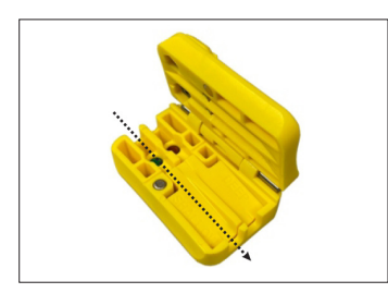
Color coded cable channels for smaller or larger cables provides complete versatility