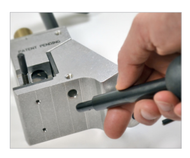
Detachable, ergonomic handles for use in tight spaces.