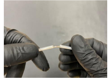
3. Snap the buffer tube to expose the inner fibers. Clean if necessary.