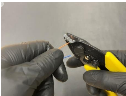
4. Use the smallest notch on the CFS-3 for individual fiber, or largest notch for flexible buffer tube.