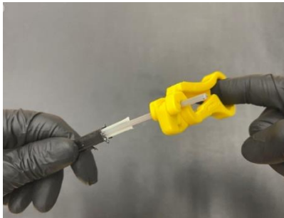
2. After trimming away the jacket, ring twice with the FTS scoring tool.