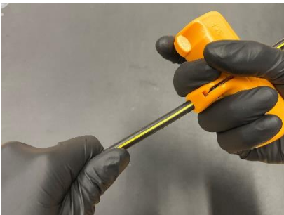
1. Use the MB04 ULW Twister drop splitter to score each side and peel away the jacket.