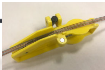
Open the tool and carefully load the blade between the 12th and 13th fiber. Ensure the ribbon lays flat in the channel