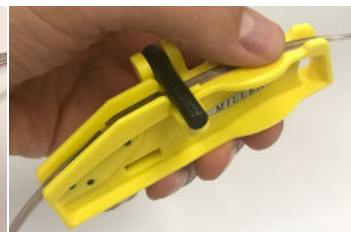
Close the clamp. Apply even thumbs pressure on the ribbon, in front of the blade. This ensures an equal tension on all the fibers.