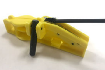
Brush debris from the blade edge using the supplied brush